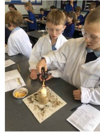
The children went to Brandeston School for a

science day, which involved visiting a planetarium and some practical experiments in a science lab. The children have made lasagne in DT and explored the USA in geography. Year 5 did a project on looking after our planet, including a visit to the seaside at Sizewell to collect and analyse the rubbish we found.